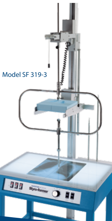
Model SF 319-3