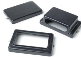
Phantom includes detachable scanning wells and air tight case.